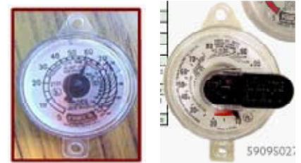
GA-5909S02733 DIAL, JUNIOR GA-5986S02733 DIAL, SENIOR