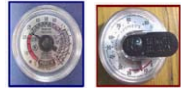
GA-130012 DIAL, JUNIOR CAPSULE GA-130022 DIAL, JUNIOR CAPSULE, REMOTE